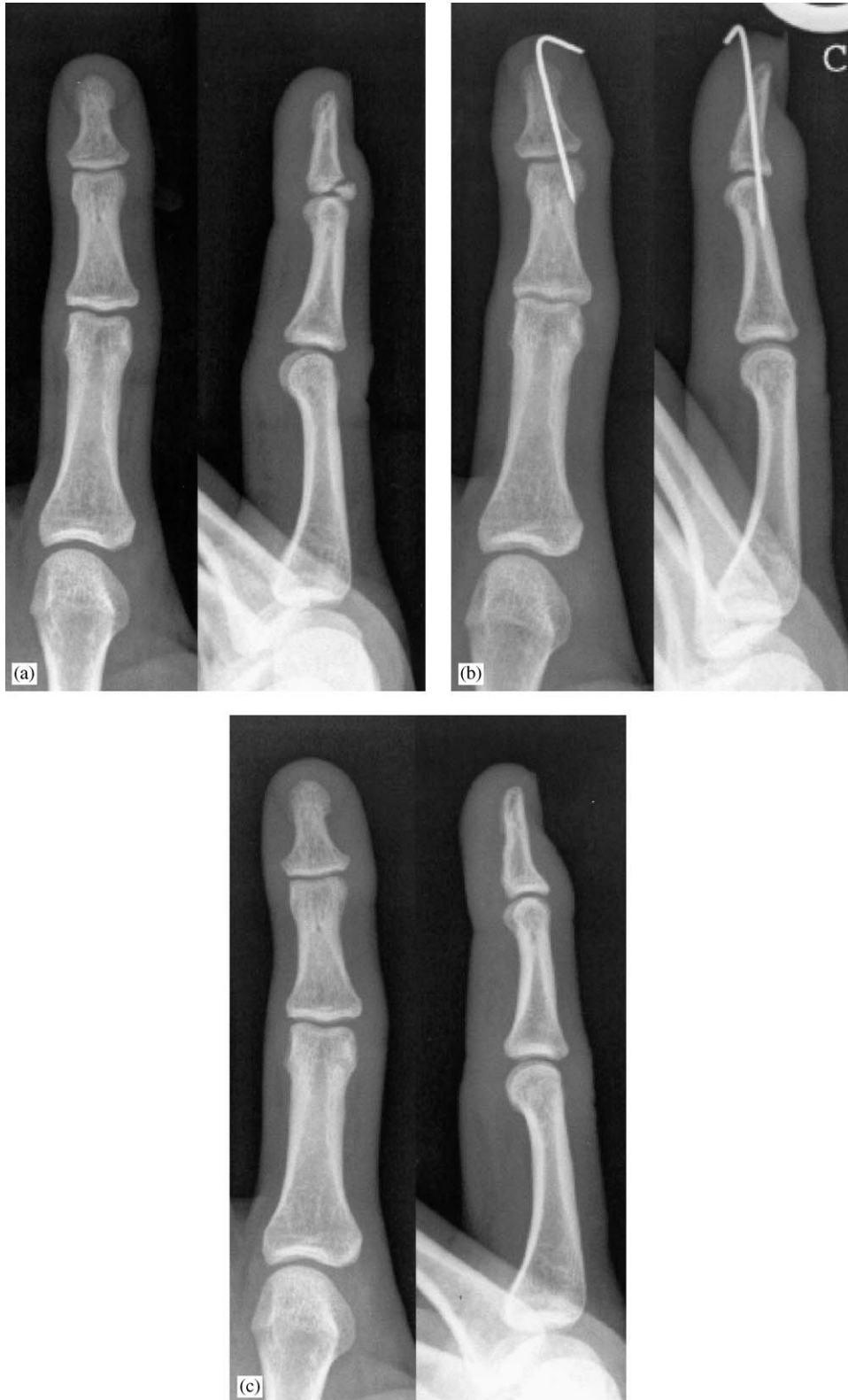
Fig 2 (a) A 22-year - old man with a mallet fracture involving more than 30% of the base of the distal phalanx. (b) Anatomic reduction, fixation of the avulsed fragment and transfixation of the distal interphalangeal joint by a single Kirschner wire. (c) At follow-up the fracture had healed in an anatomical alignment and there were no degenerative changes.