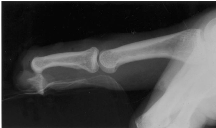
Fig 3 Case 2. The radiological appearance of the injured digit. The distal phalanx was traumatically amputated immediately distal to the DIPJ.

irrigation under regional anaesthesia the finger was terminalized immediately proximal to the DIPJ.