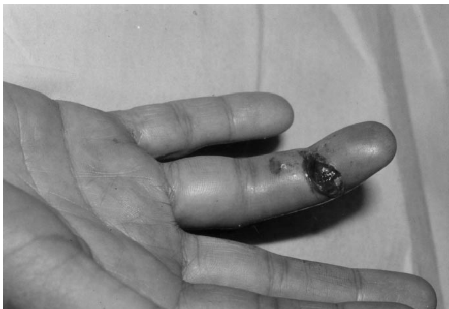
Fig 2 Case 1. A deep laceration can be seen along the radial border of finger at the level of the DIPJ.

A 52-year-old male care worker was pushing a large pamphlet through the waist-height letterbox of a wooden front door, when a Border collie bit and firmly gripped the distal phalanx of the middle finger of his dominant hand. He could not release the finger, which was held by the dog on the other side of the door. When he finally extracted the hand, the entire distal phalanx had been torn away by the dog. The amputated portion of his finger could not be retrieved. He reported to the local accident and emergency centre and was referred to our centre on the same day. He had sustained a traumatic amputation of the digit immediately distal to the DIPJ (Fig 3). After thorough debridement and